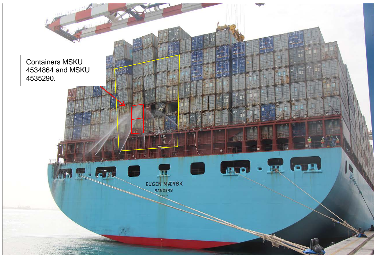
Figure 4: View of bay 90 seen from aft. Containers where fire originated marked in red. Area most affected by fire/firefighting marked in yellow.