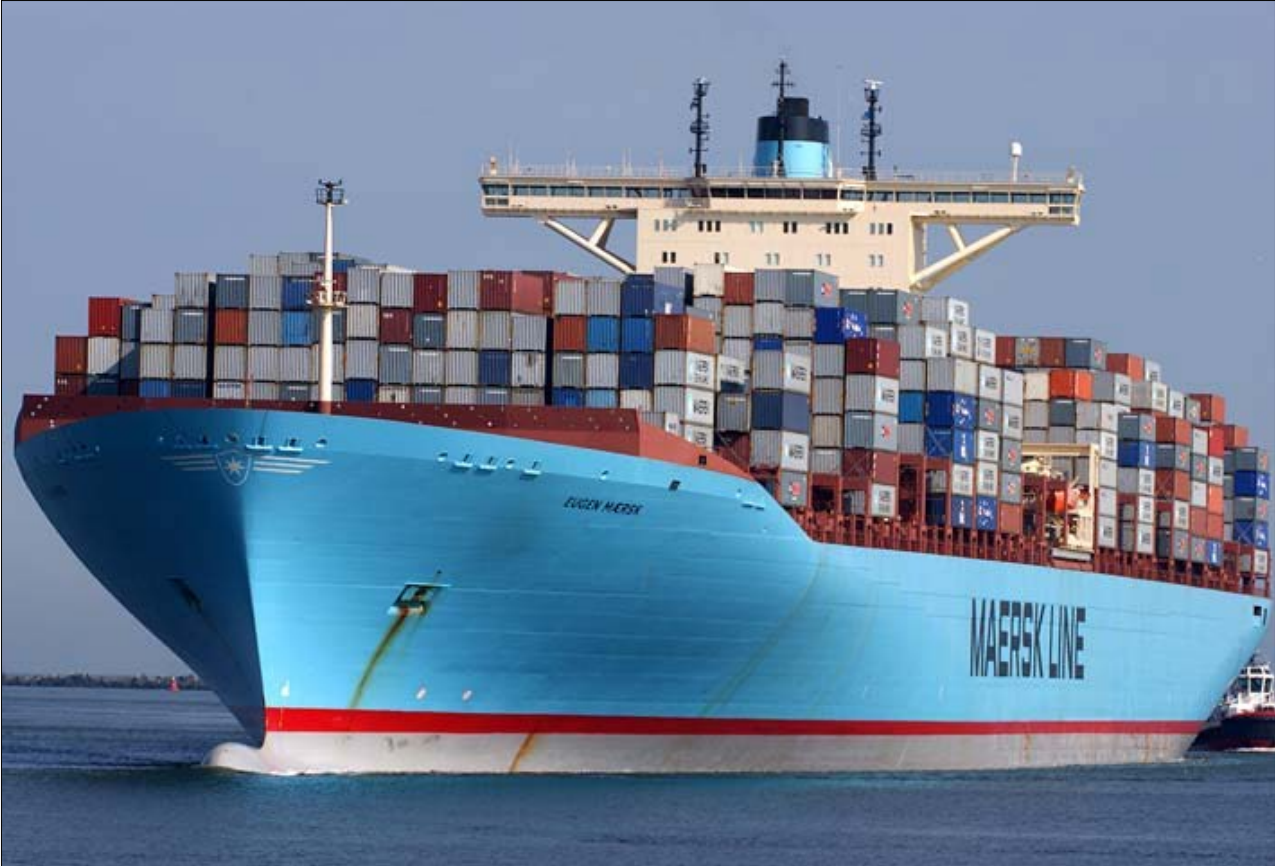
Figure 1: EUGEN MÆRSK