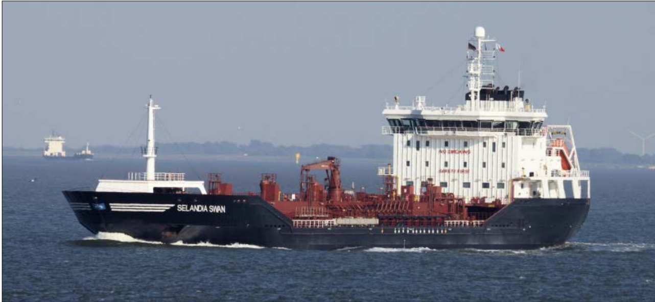
Figure 1: SELANDIA SWAN