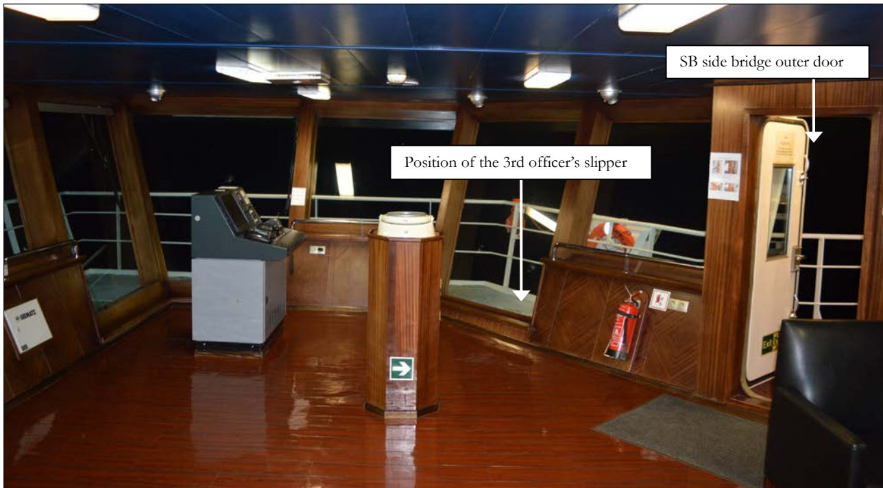
Figure 3: Picture of the starboard side bridge wing

SELANDIA SWAN's navigation bridge had closed bridge wings with outer doors on each side facing aftwards. In the picture below (figure 3) the starboard side bridge wing can be seen from where the AB noticed the open outer door and a slipper lying on the grating. The aim of the investigation of the navigation bridge was to establish the time when the 3 rd officer fell overboard and the causal circumstances of the accident.