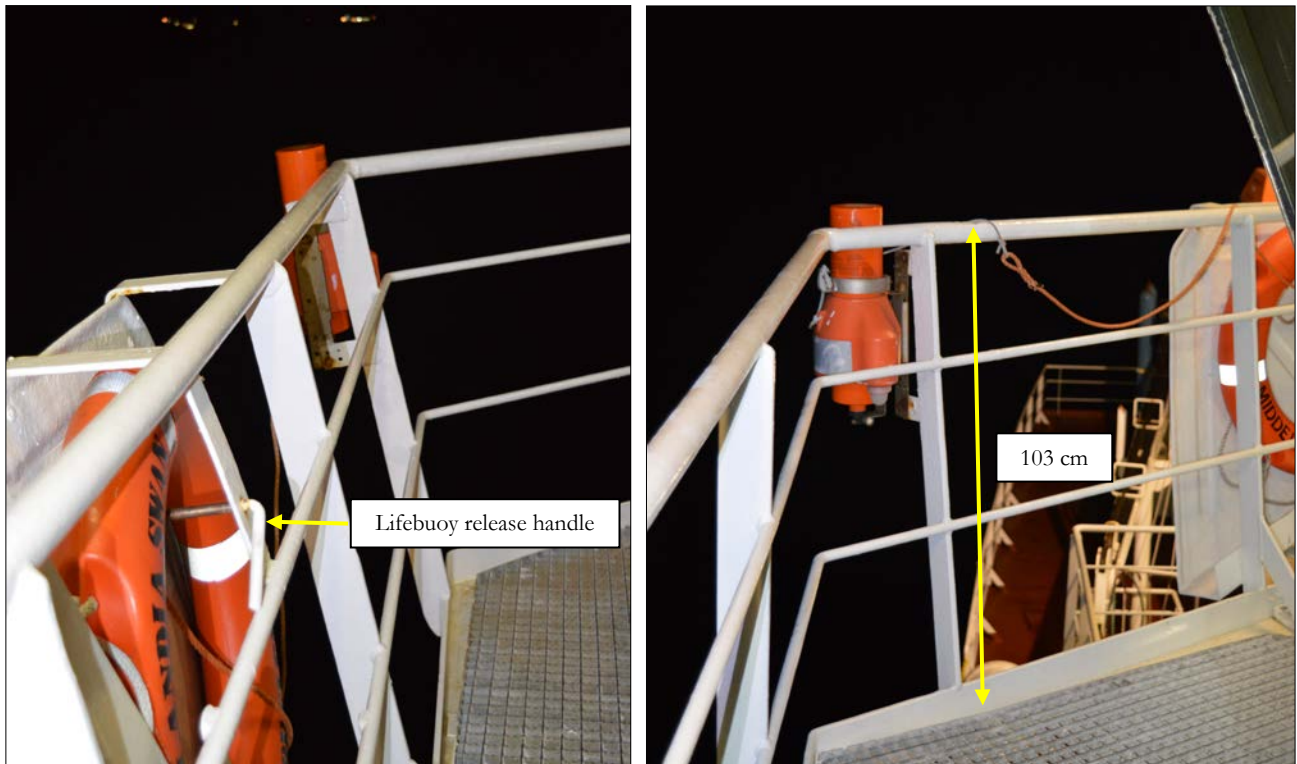
Figure 6: Overview of the workplace

The workplace for inspecting the starboard lifebuoy can be seen in the picture below (figure 6).