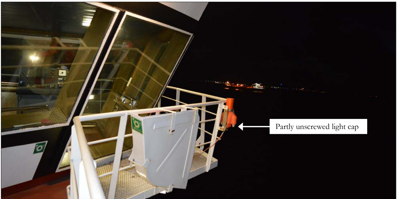
Figure 4: Picture of the starboard side lifebuoy

The slipper that was found on the grating by the starboard side lifebuoy was identified as belonging to the 3 rd officer. The other slipper was not found.